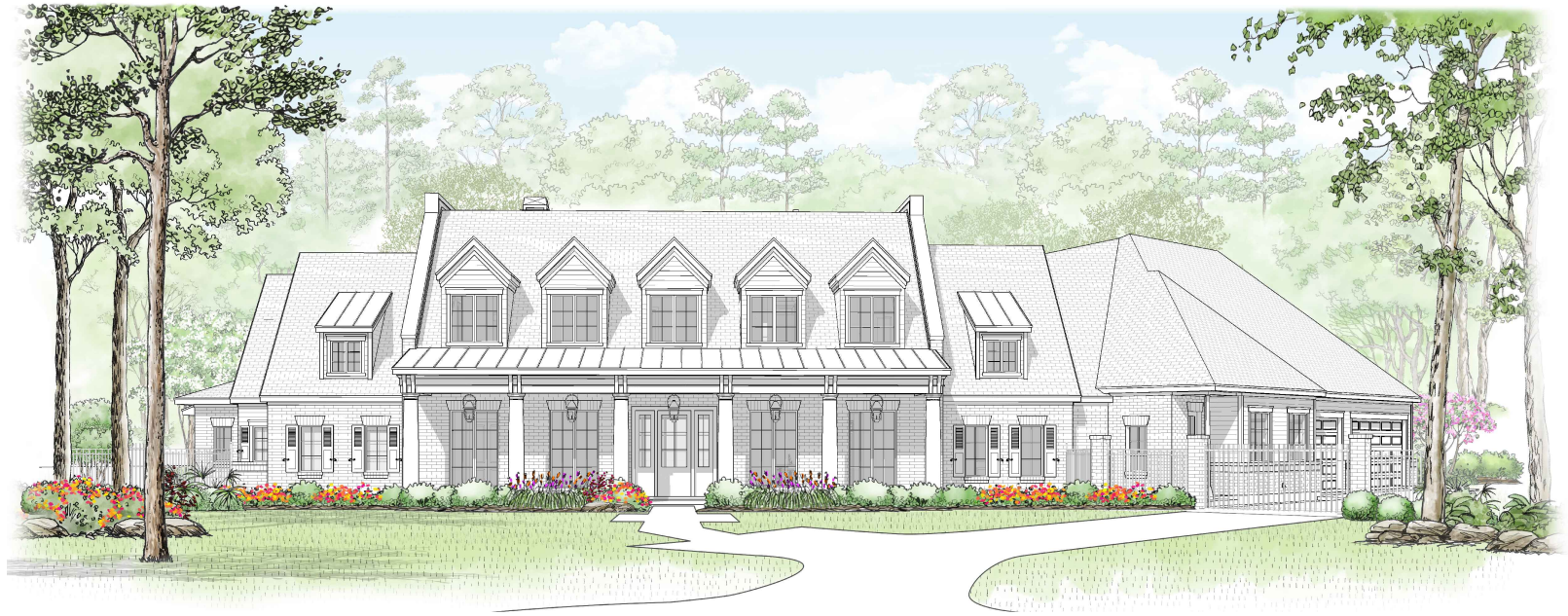
9 Valley Forge