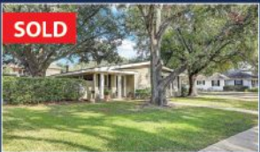
6200 DEL MONTE $669,000