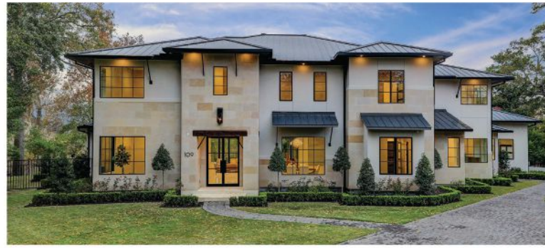
109 Radney Road | Piney Point | $6,950,000 5 BD | 6.3 BA | 9,468 SF | 1.38 Acre Lot