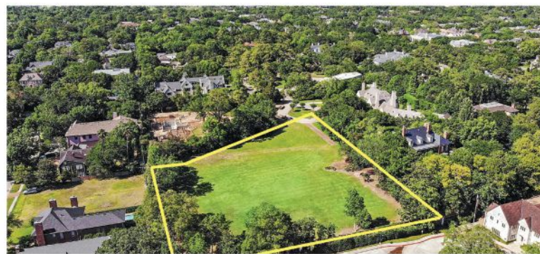
5 Briarwood Court | River Oaks | $8,900,000 2 Acre Estate Lot