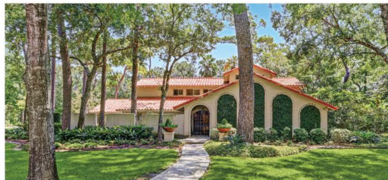
11 Liberty Bell Circle | Bunker Hill | $1,995,000 4 BD | 3.2 BA | 3,590 SF | 40,000 SF Lot

Steve Baumgardner REALTOR® 713.294.3408 steve.baumgardner@compass.com