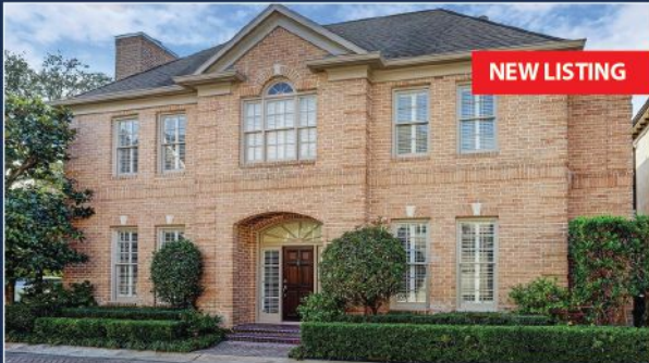
727 HIGHGROVE PARK $599,000