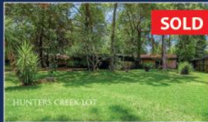
10830 ROARING BROOK 1,089,000

8955 KATY FREEWAY, SUITE 308, HOUSTON, TX 77024 713-784-7606 • WWW.ROBADAMSPROPERTIES.COM