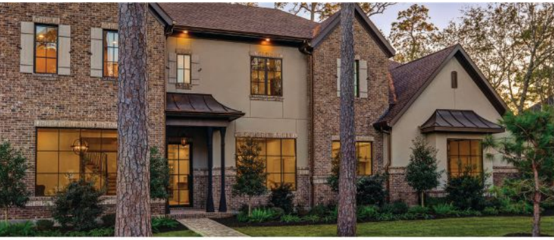
11909 Heritage Lane | Bunker Hill | $3,845,000 5 BD | 5.2 BA | 6,968 SF | 24,000 SF Lot