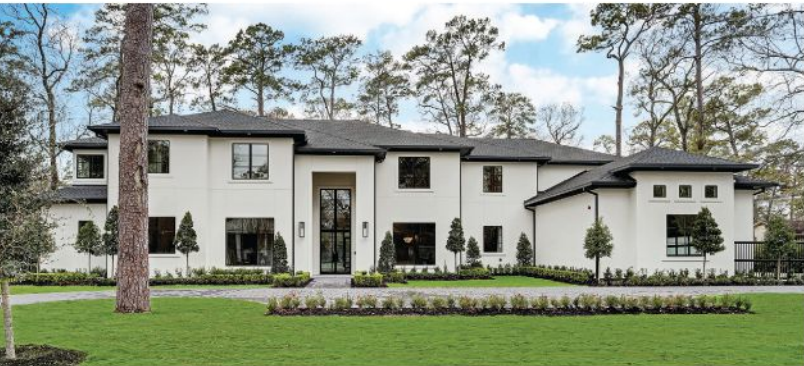
755 Marchmont Drive | Piney Point | $5,950,000 6 BD | 6.3 BA | 9,694 SF | 39,790 SF Lot