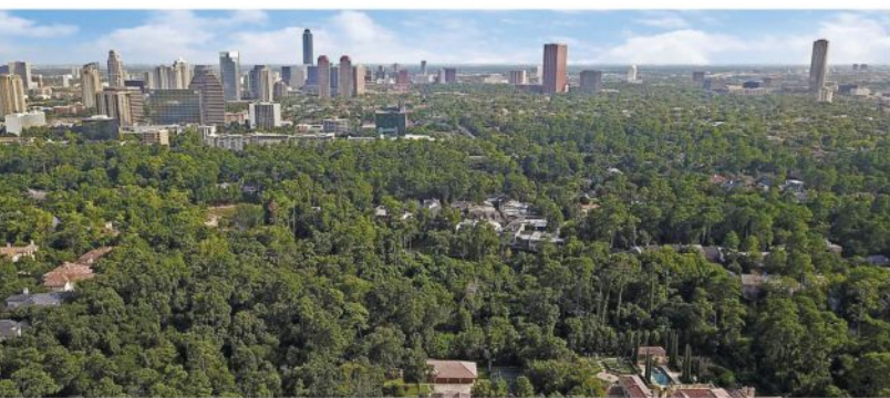
5 Farish Circle | Close-In Memorial | $5,895,000 2.2 Acre Estate Lot